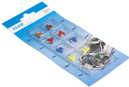
BLE7 MICRO fuses